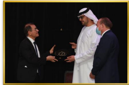
LIFETIME ACHIEVEMENT FOR ECONOMIC DIPLOMACY Nouriel Roubini - American Economist, Global Nomad Formed the Roubini Global Economic | Chairman-Roubini Macro Associate LLC