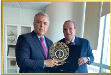
LIFETIME ACHIEVEMENT 2021 H.E. President Iván Duque Márquez President of Colombia