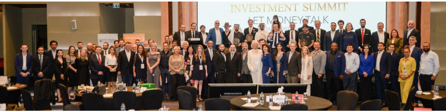
The Abrahamic Business Circle Investment Summit, LET MONEY TALK, March 2022 Edition

The Abrahamic Business Circle is an association of high-profile individuals across the globe that have a shared vision of tolerance, prosperity and peace.