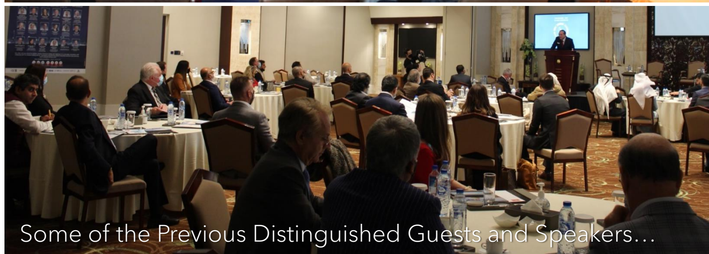
Some of the Previous Distinguished Guests and Speakers...