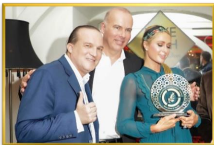
ECONOMIC DIPLOMACY AWARDS 2021 Paris Hilton & Family The Hilton family embraces the ideologies