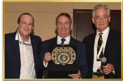
OUTSTANDING CONTRIBUTION TO ECONOMIC DIPLOMACY, 2022 The Rt Hon Liam Fox MP - Chair, UK Abraham Accords Group | Fmr Secretary of State for Defence | Fmr Secretary of State for International Trade | Fmr Minister of Foreign & Commonwealth Office