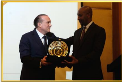
OUTSTANDING PERFORMANCE IN SOCIO-ECONOMIC DEVELOPMENT To the Government and People of the Republic of Rwanda Represented by: H.E. Edouard Bizumuremyi Minister Counsellor of the General Consulate of the Republic of Rwanda